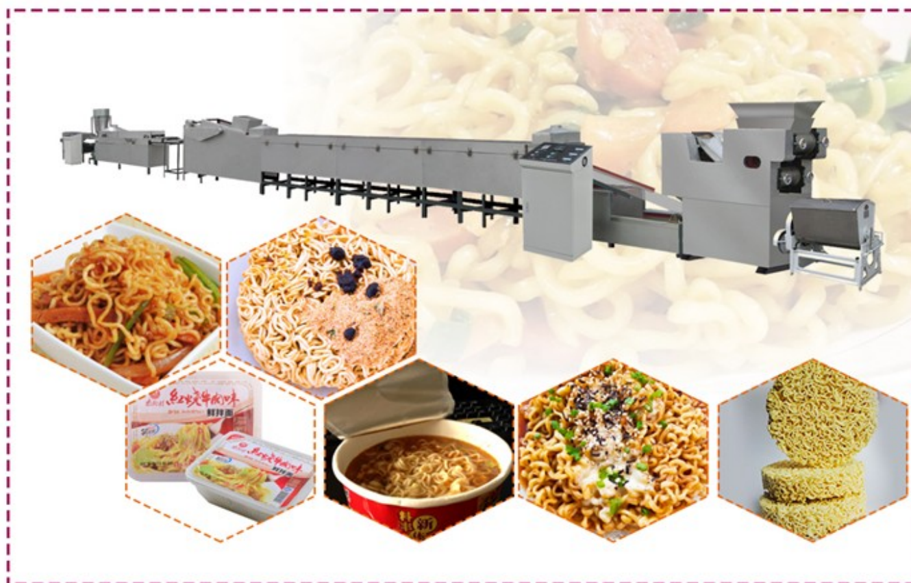
Commercial instant noodles making processing line

Automatic instant noodle production line was consisted of dough maker, forming host, steam noodle machine, cutting machine, frying machine and cooler. It is on the basis of the research of similar products at home and abroad, combined with the needs of the mass consumer market in China. With miniaturization the production features a new generation of products developed and manufactured by its technology to improve, compact design novel, stable and reliable performance. The automatic instant noodles production line from flour to finished product once complete, the high degree of automation, simple operation, moderate, production, energy saving, small footprint, the investment is only one tenth of the large-scale equipment, with less investment and quick. Special suitable for small and medium-sized enterprises.