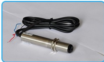
Raytek temperature controlled probe