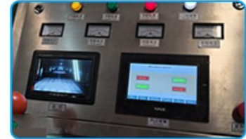
PLC control system