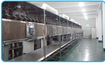
Toshiba Water-cooled Magnetron