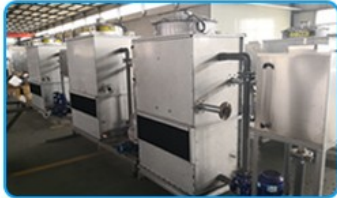
Closed cooling tower