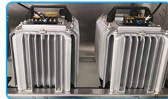
Microwave power supply

I ask the Indonesia customer is the purpose of drying this grasshopper larvae for pharmaceutical purposes?