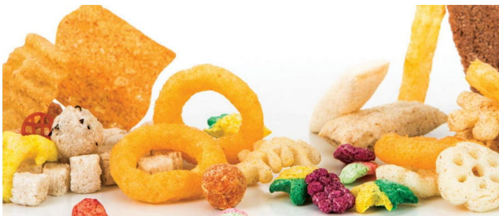
sample of Microwave Bake Puffing Equipment processing

My reply: The appearance and color of the products baked by the microwave baking equipment remain unchanged, the particles are puffed and full, the taste is crisp, and it has the functions of killing insects and sterilizing.