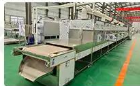
6. Machine Material : 304 stainless steel