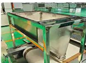
2. Material Feeder : Customizable according to your materials, both Liquid & Powder & Pellet available