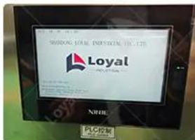
1. PLC control system