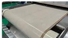
3. Belt: Customizable mesh belts of various materials