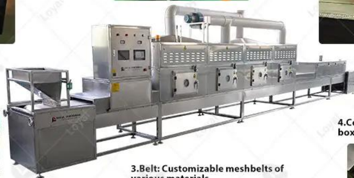
3. Belt: Customizable mesh belts of various materials